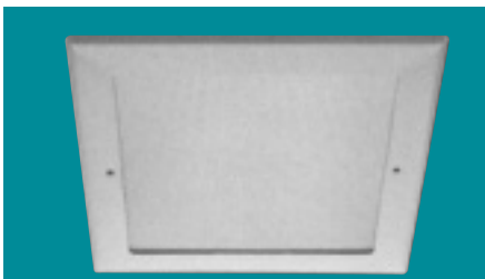
Door frame with FP lens

Swing door frame to closed position and tighten screws.