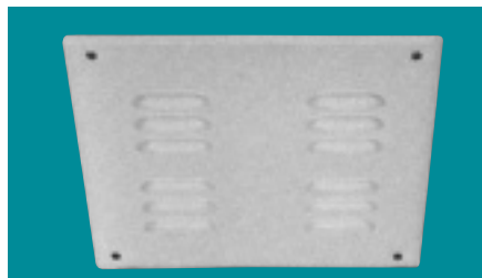
Vented cover-up with screen